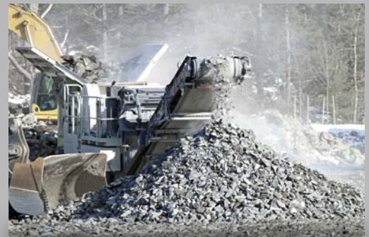
PORTABLE with ANGLE SENSOR

Daily, weekly, monthly, yearly, and resettable job totals, along with calibration and production data logs are stored on the internal USB drive for verification of production at each jobsite.